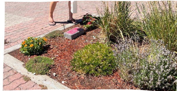
STREET CORNER GREENERY NODES