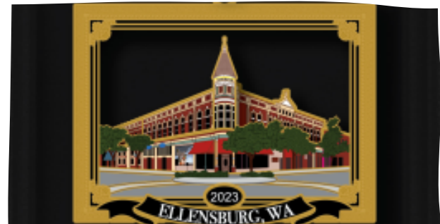
ANNUAL HOLIDAY ORNAMENT